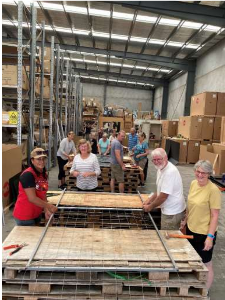
Blackies ART SHOW Working Bee