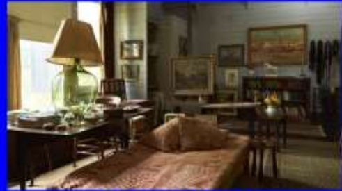
The Xxxroom today