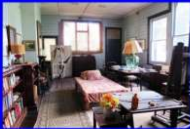
The Xxxroom from the Doorway