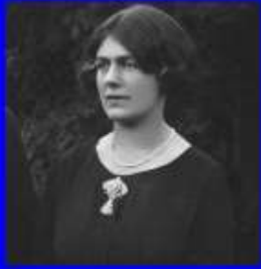
Lady Joan Lindsay c 1925