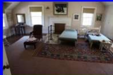
An Upstairs Bedroom