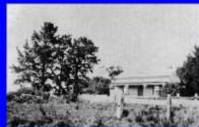
The original Mulberry hill home c 19xx