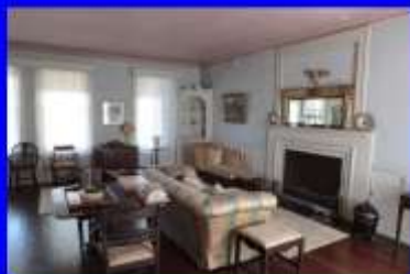
The Lounge Room