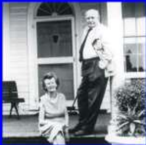
At Mulberry Hill 1970s