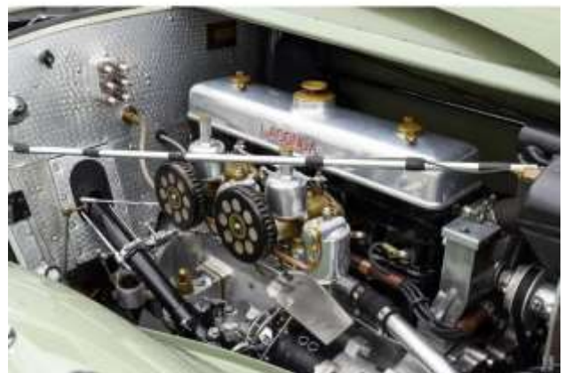
Walter's Lagonda masterpiece