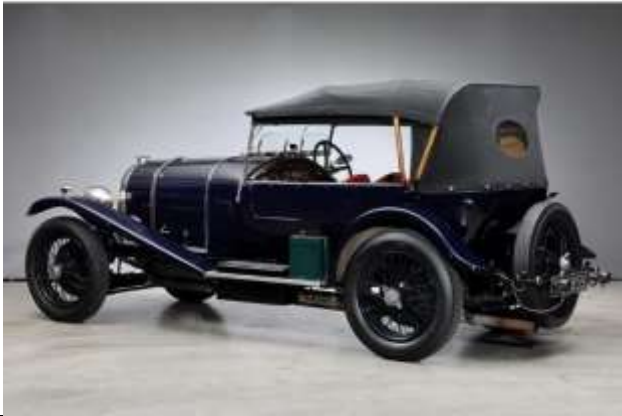
Supercharged 41/2 litre