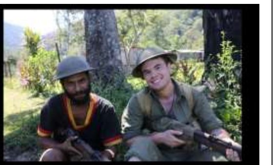
Royal Papuan Constabulary