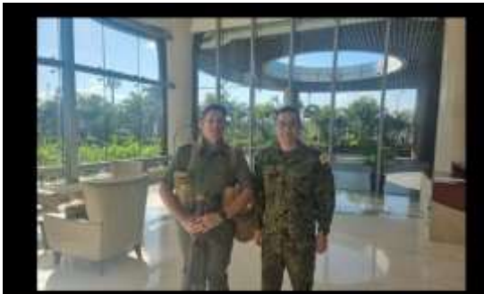
Current Japanese Army Officer