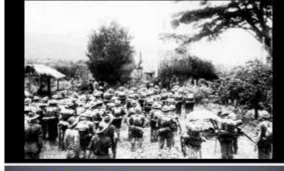
2 November Kokoda reoccupied by Australians