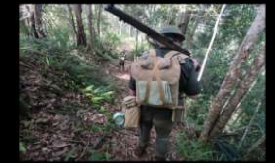
Somewhere on the Track