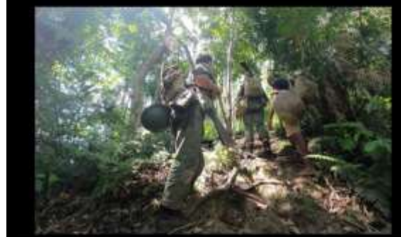
Really steep ascent