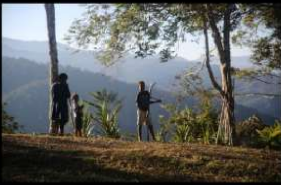
What do the locals think?