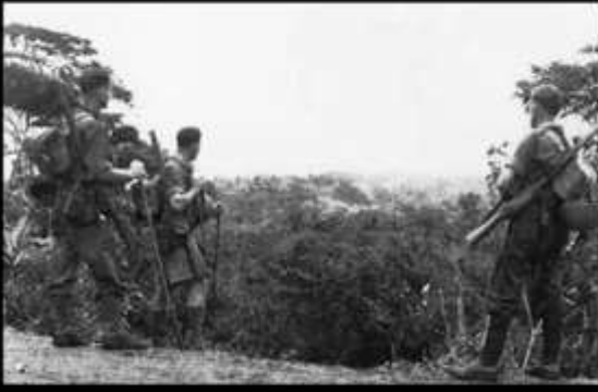
Australian troops at Ioribaiwa on the advance