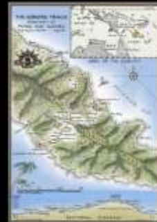
The Kokoda Track