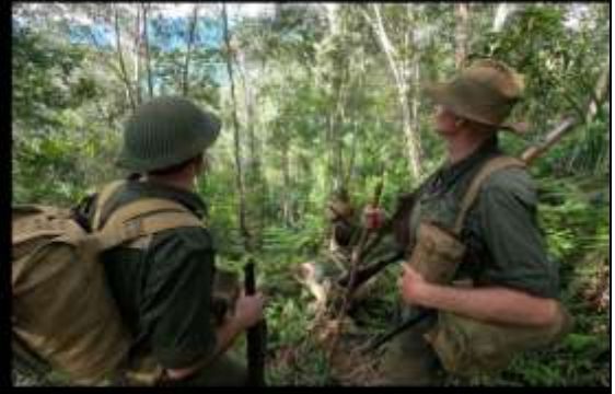
Towards the Owen Stanley Range