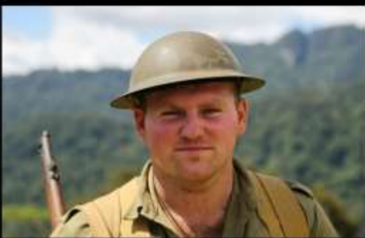
Tin hat in the jungle