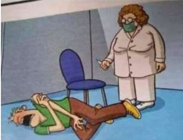
First professional soccer player vaccinated