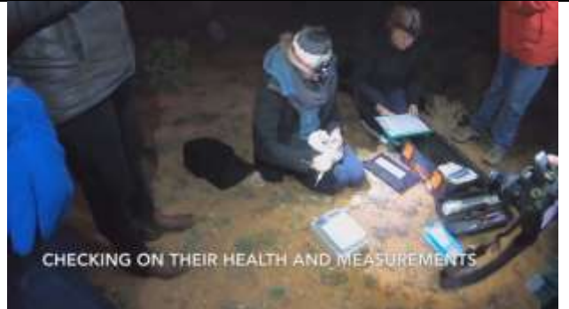
CHECKING ON THEIR HEALTH AND MEASUREMENTS