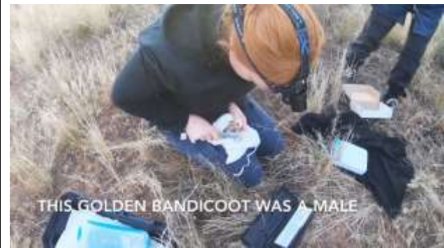
THIS GOLDEN BANDICOOT WAS A MALE